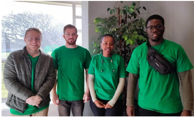
The Green Hats