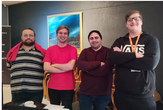
Catch Me If You Scan